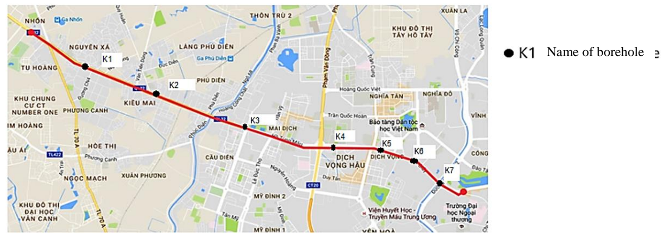
Figure 1. The location of sand samples.